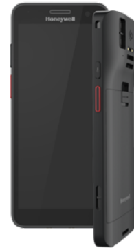
The CT37: 5G mobile computer on the Mobility Edge™ platform, elegant, slim, powerful, durable, and easy to use.

The Honeywell CT37 is a lightweight, durable, rugged, and all-purpose hand-held device, providing reliable performance, 5G data connectivity and communications for frontline mobile workers.