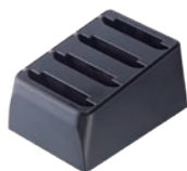
4-slot Battery Charger