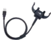
USB snap-on Cable